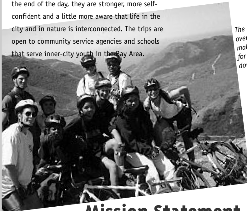
The vista from the top of this hill overlooking Tennessee Valley sure makes the climb worth the effort for our riders (once they cool down, of course).