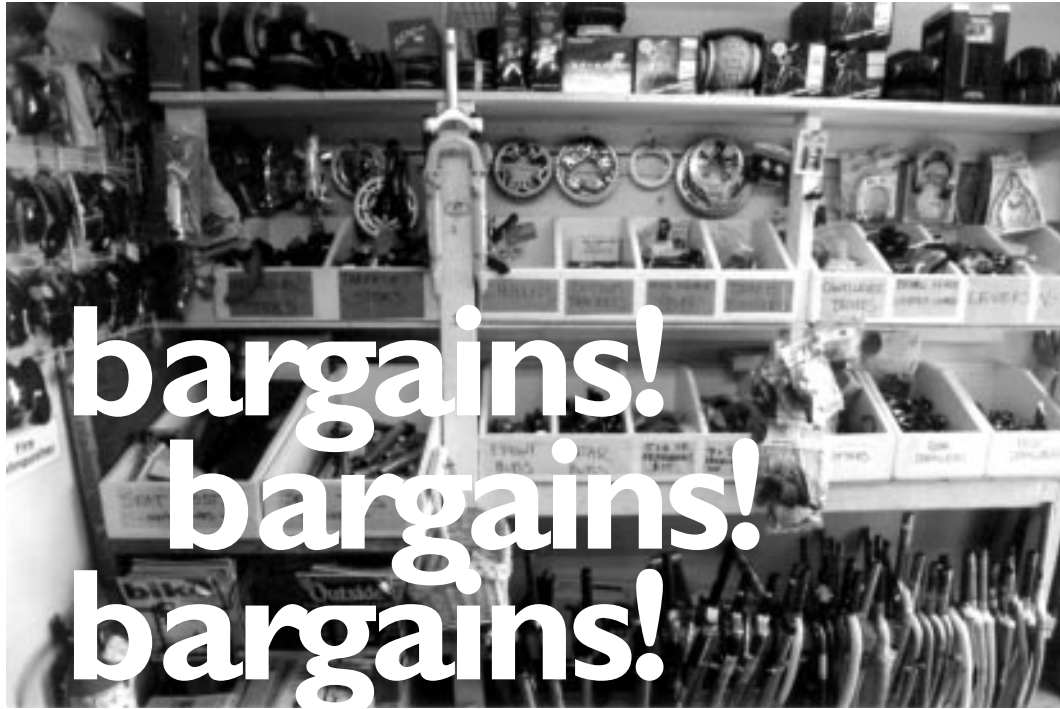
Re-Cyclery's parts room is filled with great deals.